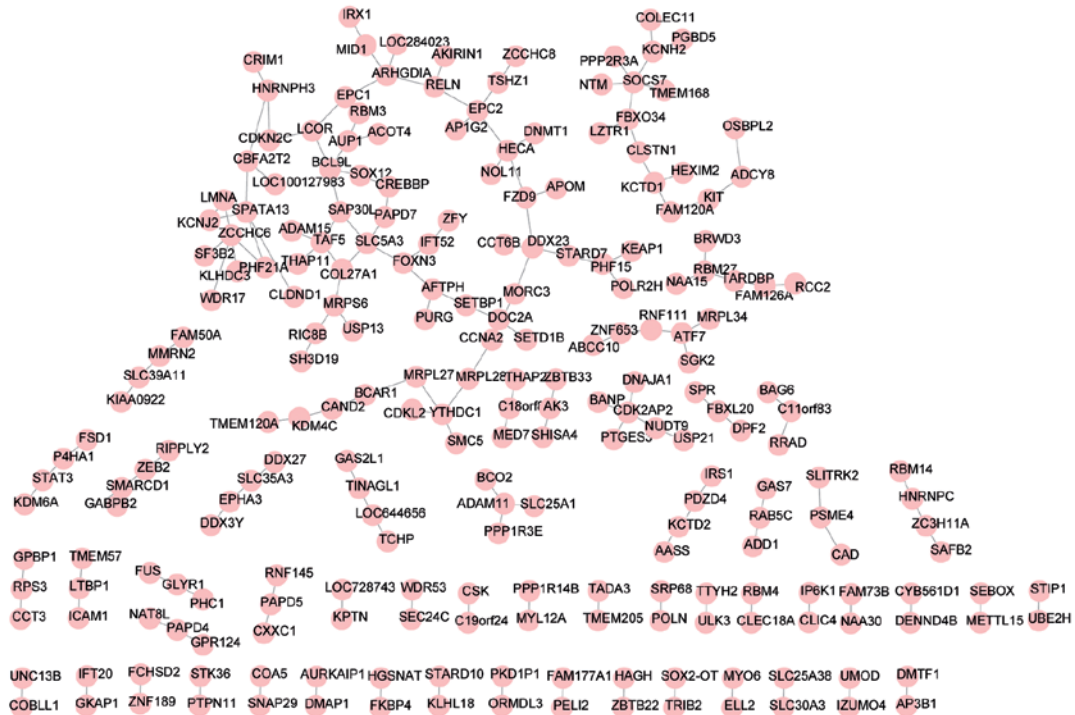
Figure 1. The co-expression network of Parkinson' disease (PD). This network consists of 230 DCGs and 614 DCLs. DCLs, differentially regulated links; DCGs, differentially co-expressed genes (Supplementary Tables SI and SII)