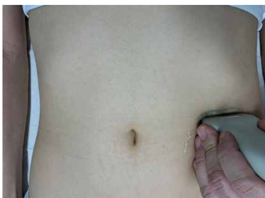
Figure 1. Point of application of ultrasound transducer

The data collected for the purpose of the present study were arranged in a Microsoft Office Excel 2007 spreadsheet. Statistical analysis was carried out using the Statistica Stat Soft program. In order to characterize the analyzed population, basic tools of descriptive statistics were used, i.e. quantitative and percentage descriptions, mean values and standard deviation. For the purpose of comparison of the two groups, Student’s t -test for two independent samples was used. In the case of no homogeneity of variance, a non-parametric test, the Mann-Whitney U -test, was applied. The Kruskal-Wallis test was applied for comparison of